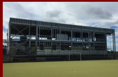
Walls and window frames are now taking shape