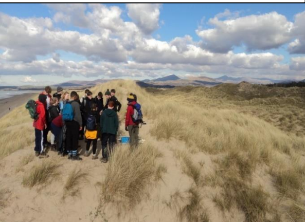
Year 12 students at Harlech Sand Dune, Snowdonia