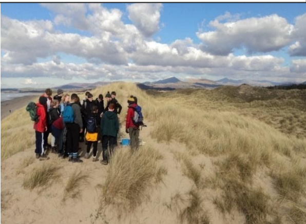
Year 12 students at Harlech Sand Dune, Snowdonia

The A Level course has a large emphasis on fieldwork and students learn through their own enquiries. All students must carry out a minimum of four days of fieldwork, all of which is provided through the school. An excellent six-day residential field trip is organised at the end of the spring term (cost approximately £600) during which students practise a variety of skills and fieldwork methods that relate to processes in both Physical and Human Geography, while exploring a fascinating and beautiful part of the country. All students have to carry out their own fieldwork investigation with a written report of 3000 – 4000 words which accounts for 20% of the A Level qualification. This allows for students to research an area of the subject that they are most interested in.