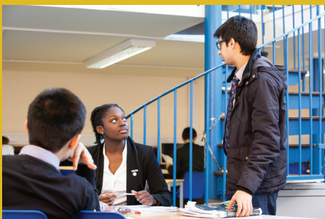
Sixth Form Study Centre Use of Legacy Space