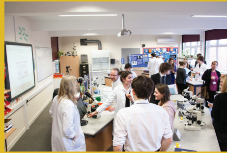
Science Labs Refurbishment