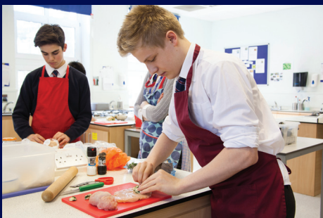
Food Technology Use of Legacy Space