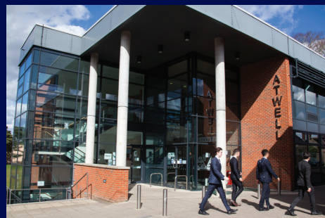
The Atwell Building New Build