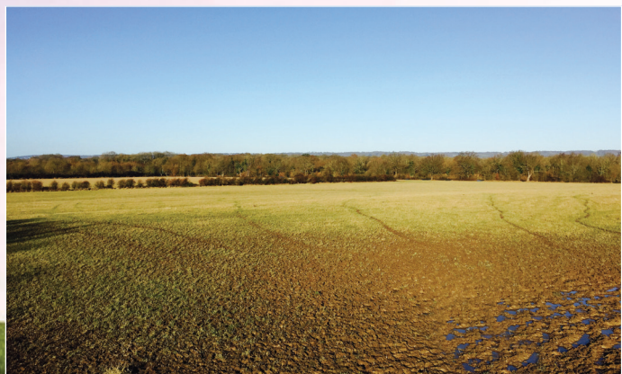
New fields to be known as Vizards

Two new fields, adjacent to Haysden Country Park, to be known as Vizards, were bought by the school in December 2014. The first field (13 acres) will be developed over the next year and be ready for use in September 2016. This will double our playing facilities for cricket and rugby – a much needed response to the growth of our student numbers and sporting activities over recent years. It will provide four new rugby pitches in the winter (two full size and two large junior size) and two cricket pitches in the summer (one grass square and one artificial strip). We are investing heavily in drainage and surface improvement to ensure the facility is of the highest quality.