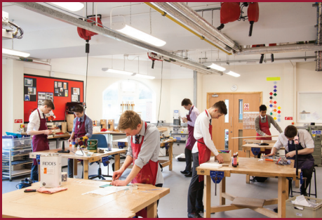
Design & Technology Refurbishment