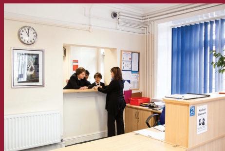
Reception & Administration Offices Refurbishment