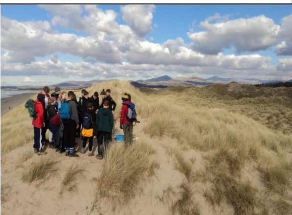
Year 12 students at Harlech Sand Dune, Snowdonia