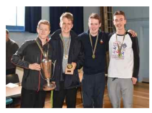
The Senior Cross Country Squad

Overall it was an excellent day and we look forward to the Whole School Run (Handicapped Race) starting at 4pm on the Pool Pitch on Wednesday 29 March. All welcome!